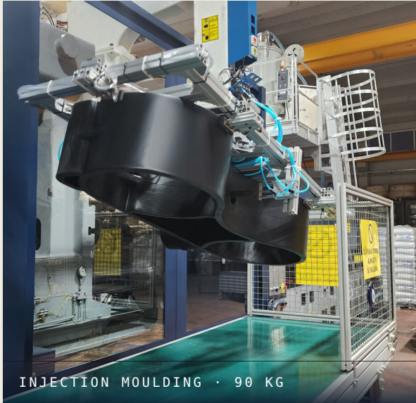
INJECTION MOULDING · 90 KG